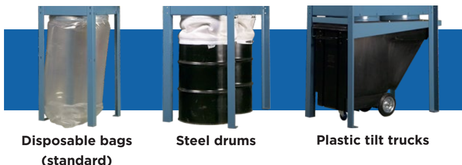
Disposable bags (standard)