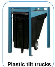
Plastic tilt trucks