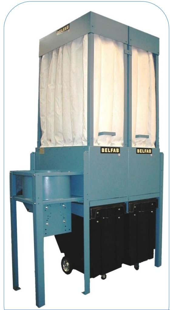
Complies with NFPA 664 standards for indoor installations