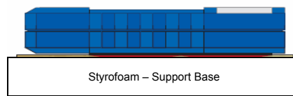
HM8 - WS1

How it works: As soon as the sensor plate is in contact with the surface of the wood, measuring starts. The processor of the instrument analyzes the sensor readings and displays the result as a percentage of moisture content in the wood.