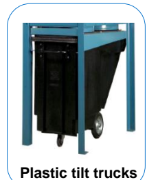
Plastic tilt trucks