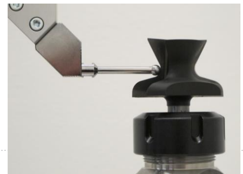
Spherical track feeler for shaped cutters (optional)