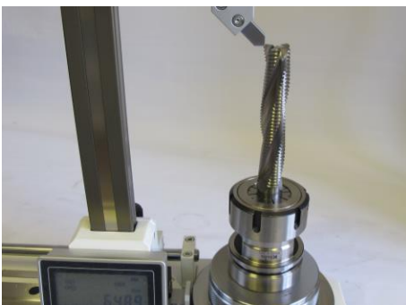
Standard track feeler