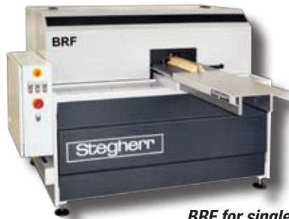
BRF for single end processing

On the double end BRF the profiles are fed fully automatically from a horizontal feeder. An original patented outfeed system returns the finished workpieces underneath the machine table to the operator.