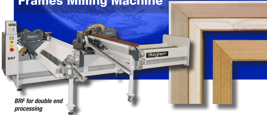
BRF for double end processing

The Stegherr BRF machine can mill pre-cut profiles (c. 250 – 3000 mm long) for the manufacture of stretcher bar frames (tongue and groove). Two machine versions are available: For double end and for single end processing.